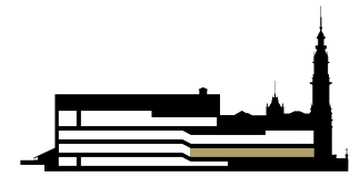
GLENROY AUDITORIUM | CAPACITY CHART