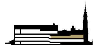
CONFERENCE ROOM 1 | CAPACITY CHART