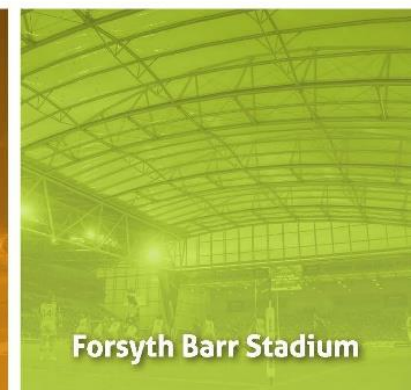
Forsyth Barr Stadium